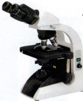
Shown with Binocular Head

Optional Items: Ceramic Coated Mechanical Stage, Tilting Ergonomic Head, Trinocular Bridge, Multi-Observation, 2x, 20x, 50x Oil, 60x Infinity Plan Objectives, Fluorite Optics, Fluorescents, Polarizer/Analyzer