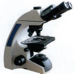
Shown with Trinocular Head

Bio Imager Microscope offers outstanding optics and mechanics at an affordable price. The Bio Imager Series comes standard with 10x/22mm eyepieces, Infinity Corrected Plan 4,10,40,100x objectives, 218mmx150mm mechanical stage with specimen holder, abbe 1.25 condenser with iris, Koehler illumination with 6v/30w bulb, Contrast Enhancement Filter (not your standard blue filter), CE approved electronics, dust cover, immersion oil, 5 year warranty