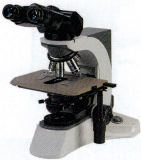
Shown with Tilting Head and Ceramic Stage

Bio Scope II Binocular or Trinocular Microscope with beautiful optics and mechanics at a great price. The Bio Scope II Series comes standard with 10x/22mm eyepieces, Infinity Corrected Plan 4,10,40,100x objectives, Anodized 216mmx150mm mechanical stage with specimen holder, abbe 1.25 condenser with iris (marked for objective settings), Koehler illumination with a 3w LED bulb, CE approved electronics, dust cover, blue filter, immersion oil, 5 year mechanical warranty and 1 year electrical warranty